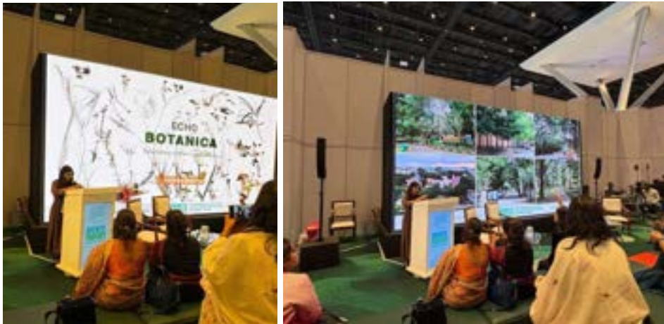
6. Pop-up kiosk at the Bioconserve Summit 2026